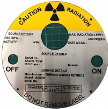
Stainless Steel, acid etched and paint filled 2 colours