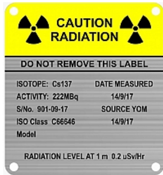
Stainless Steel, acid etched and paint filled 2 colours