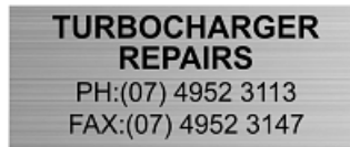
Stainless Steel, acid etched and paint filled