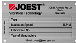
Stainless Steel, acid etched and paint filled 2 colours