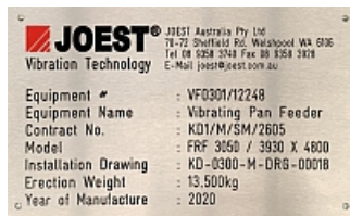
Stainless Steel, Router Engraved, Industrial Compliance, 2 colour Paint Fill