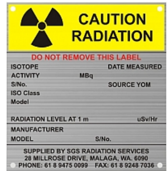
Stainless Steel, acid etched and paint filled 3 colours