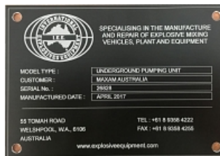
Laser etched Black Anodised