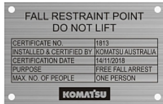
Stainless Steel, acid etched and paint filled