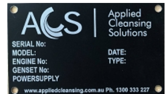
Laser etched Black Anodised