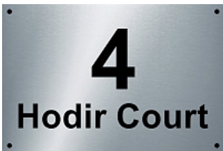
300 x 200mm House Sign