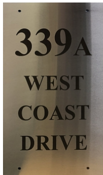
Laser Etched House Sign