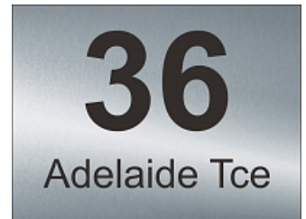
400 x 300mm House Sign