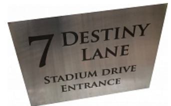
Laser Etched House Sign