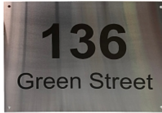
Laser Etched House Sign