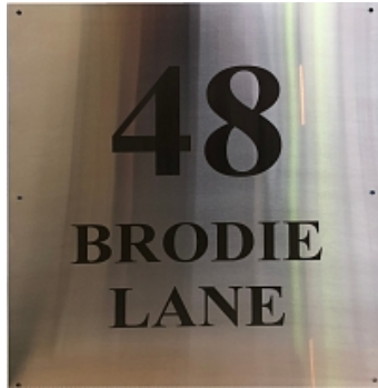
Laser Etched House Sign