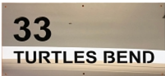
Stencil Cut Mirror Finish House Sign