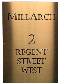
Brass Finish on Stainless Steel