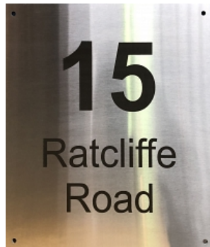
Laser Etched House Sign