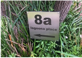
Laser Etched House Sign