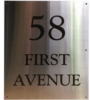
Laser Etched House Sign