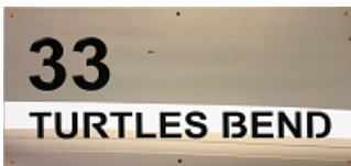
Stencil Cut Mirror Finish House Sign