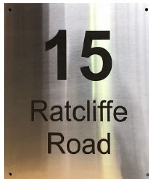
Laser Etched House Sign