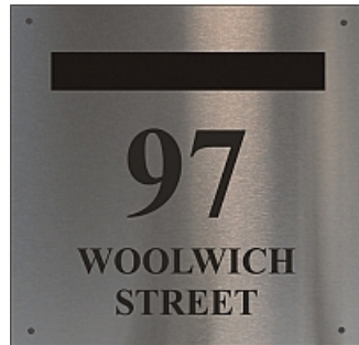
320 x 360mm