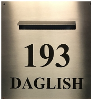
400 x 420mm with Weather Hood