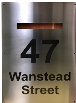
Laser Etched Charcoal Black