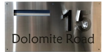
Laser Etched details and 3D fabricated Stainless Numbers