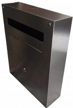
Front Entry with Lockable Door and Back Box assembly