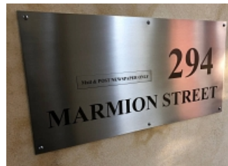
700 x 350mm with Weather Flap