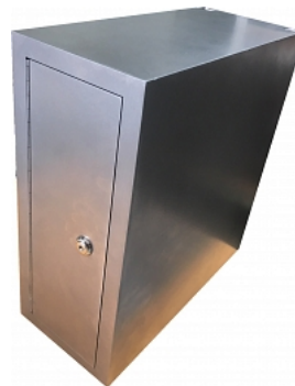
Locking Backplate and Box for Picket Fence