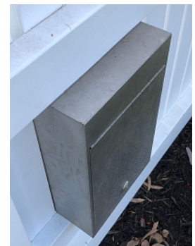
Rear Box and Backplate, Picket Fence Style