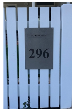
Laser Etched Charcoal Black, Picket Fence Style