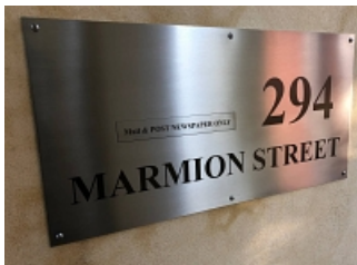
700 x 350mm with Weather Flap