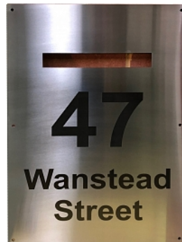
Laser Etched Charcoal Black