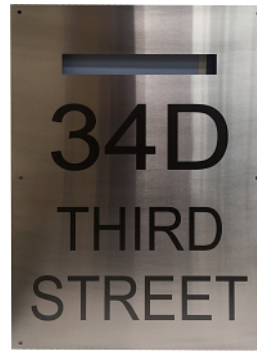
400 x 600 mm