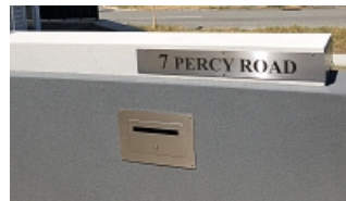
Front Entry Letterbox