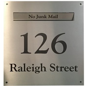
320 x 360mm with Weather Flap