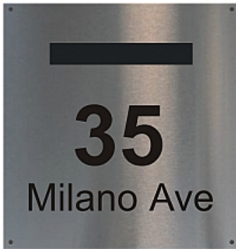
400 x 420 mm