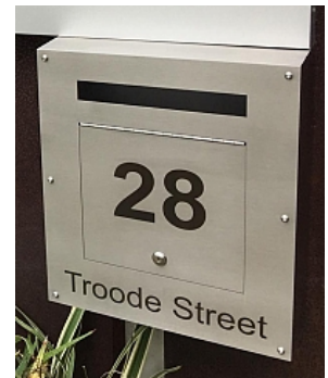
Front Entry with Lockable Door and Back Box assembly