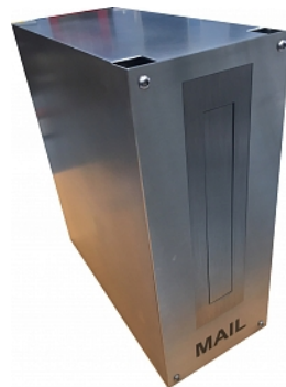
Vertical Mail Slot and Box for Picket Fence