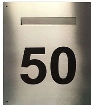
400 x 480mm with Weather Flap