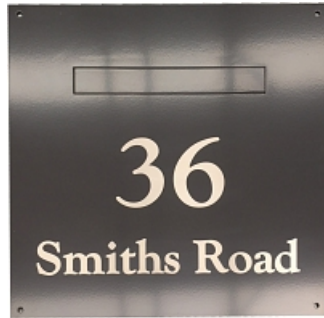
Charcoal Metallic, Laser etched Stainless Steel