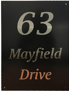
Charcoal Metallic, Laser etched Stainless Steel