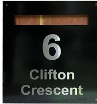
Satin Black, Laser etched Stainless Steel