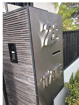
3D fabricated with LED