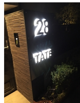
3D fabricated with LED