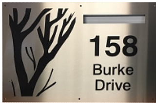
Laser Cut Stencil Letters and Numbers, Black Background