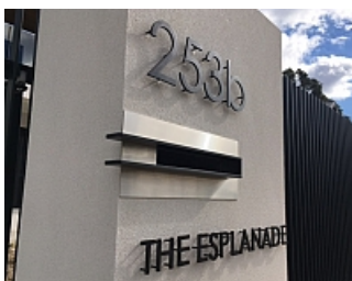
Laser Cut Letters and Numbers