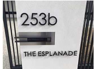
Laser Cut Letters and Numbers