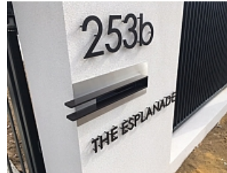
Laser Cut Letters and Numbers