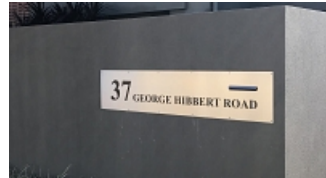
Laser Cut Stencil Letters and Numbers, Black Contrast Background, 1800mm x 300mm