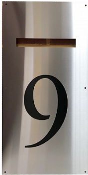
Laser Cut Stencil Letters and Numbers, Black Contrast Background