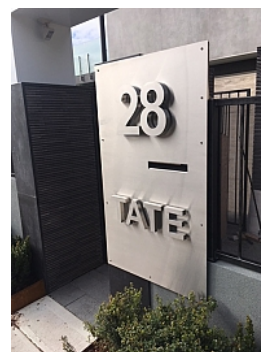
3D fabricated with LED