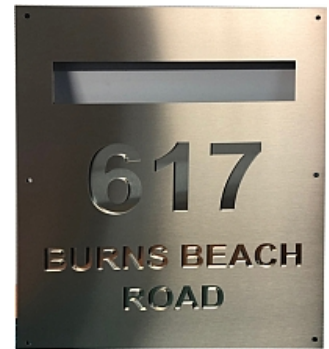
Laser Cut Stencil Letters and Numbers, Stainless Background